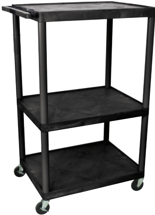
LP54E-B 32"W x 24"D x 54 1/4"H