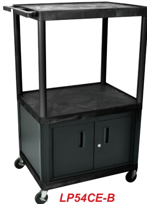
LP54CE-B 32"W x 24"D x 54 1/4"H