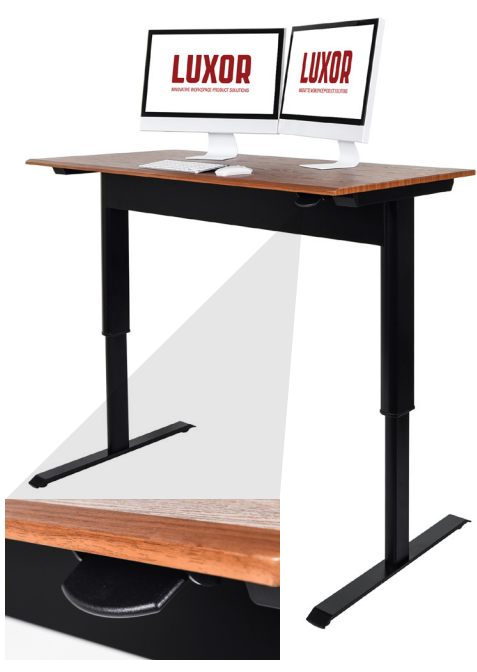
Easily adjust the height between 27.5" and 44.5" with lever-activated pneumatic air cylinder