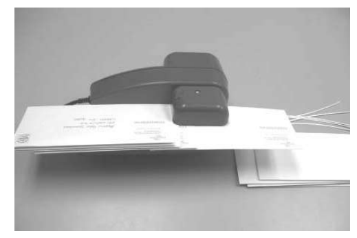
Step 4. Depending on the condition of the envelope edges and flatness, the entire stack should automatically feed until the stack is completed. However, under previously mentioned conditions of the envelopes, you can depress the START button to begin feeding again if it hesitated and did not complete the stack.