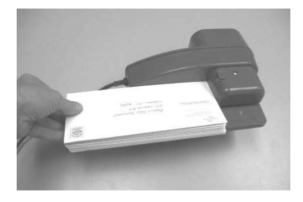
Step 2. Place up to 10 prepared envelopes onto the feed tray with the bottom edges of the envelopes back against the opener housing and also against the top cover that contains the START button.