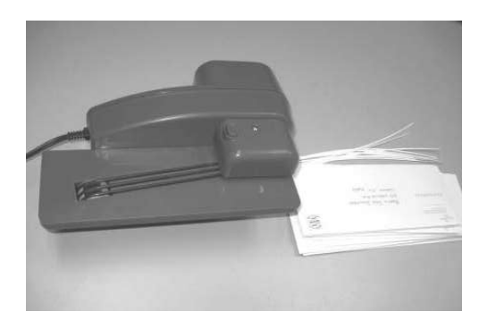
Step 5. Your stack of envelopes will be stacked on the right side of the unit and the scrap is easily separated from your opened envelopes. The cut edges of your envelopes are cut such that they are unlikely to cut or injure fingers.