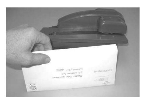
Step 1. Prepare up to 10 standard envelopes to be opened by tapping the top sealed flap side down firmly on desktop several times. This will cause the envelope contents to slide to the opposite side of that to be opened.

NOTE: If unit jams during operation, unplug the unit and clear all jams. Then reinstall the power plug.