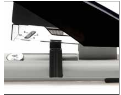
Adjustable depth guide ensures you staple at the desired depth each and every time.