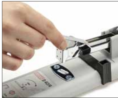
Dual staple guide system provides even pressure on the staple legs until it clinches your documents.