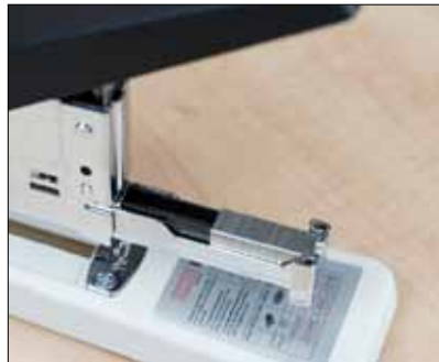
Dual staple guide system provides even pressure on the staple legs until it clinches your documents.