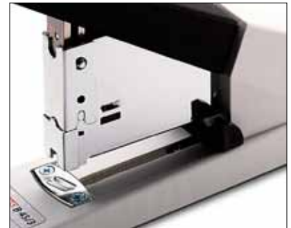
Adjustable depth guide ensures you staple at the desired depth each and every time.