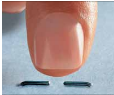
Staple legs are bent and pressed flat after stapling which provides 30% more binder storage