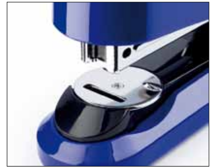
Adjustable insert for permanent or temporary stapling as well as tacking.